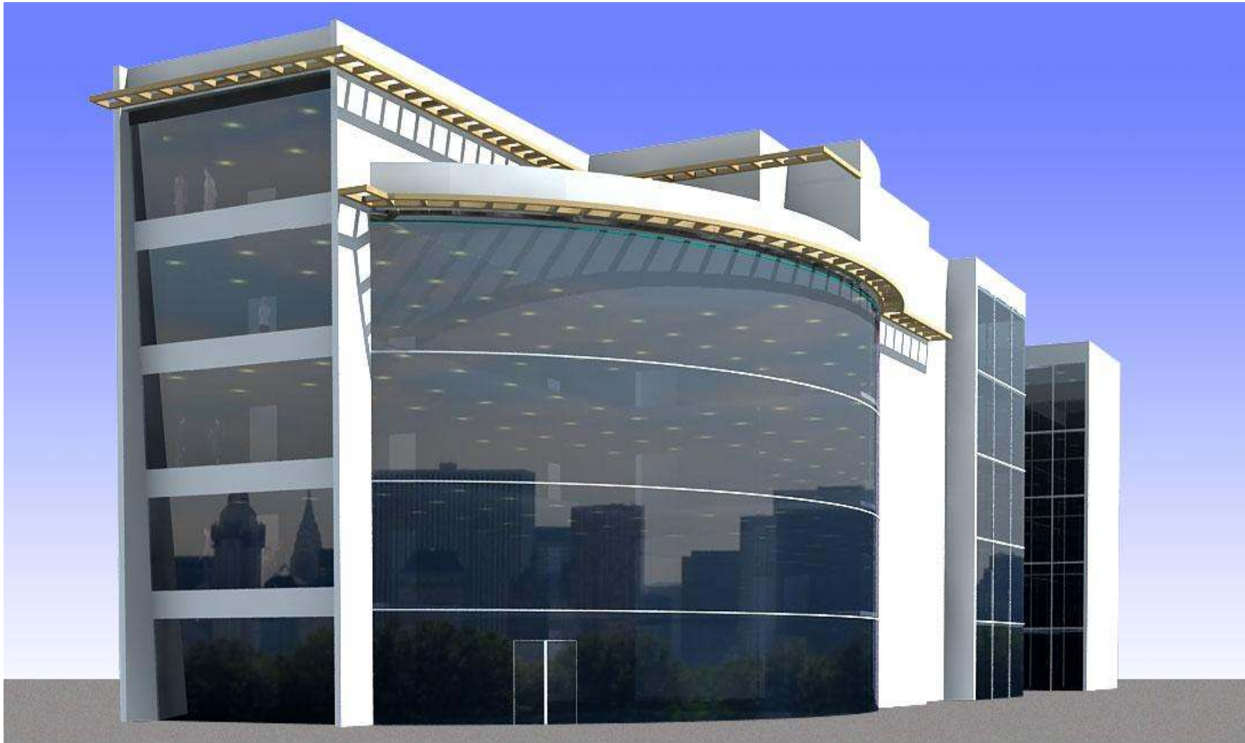
TULIP COBSE (Sector-18,Gurgaon)